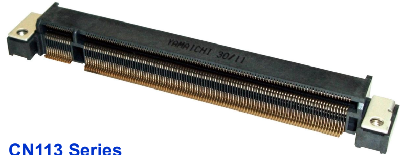
CN113 Series Infotainment Module Connector