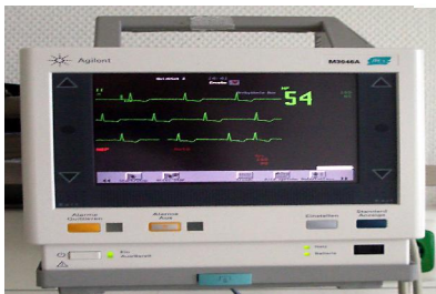
Medical Hand-Held & Stationary Systems