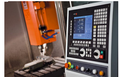
Industrial & Ruggedized Computers