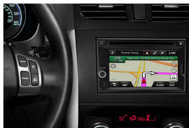
Automotive Infotainment & Vehicle Navigation Unit